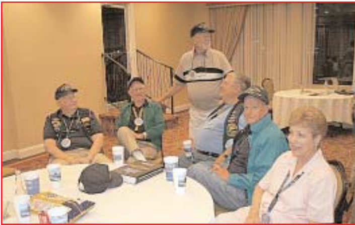
Hospitality Room . . .