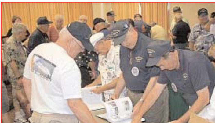
After the business meeting there was opportunity to get your Sea Poacher Book autographed by the authors.