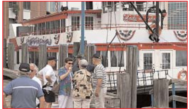
It was a dreary, overcast and sometimes raining morning but the cruise on the St. John River, in Jacksonville was very enjoyable.