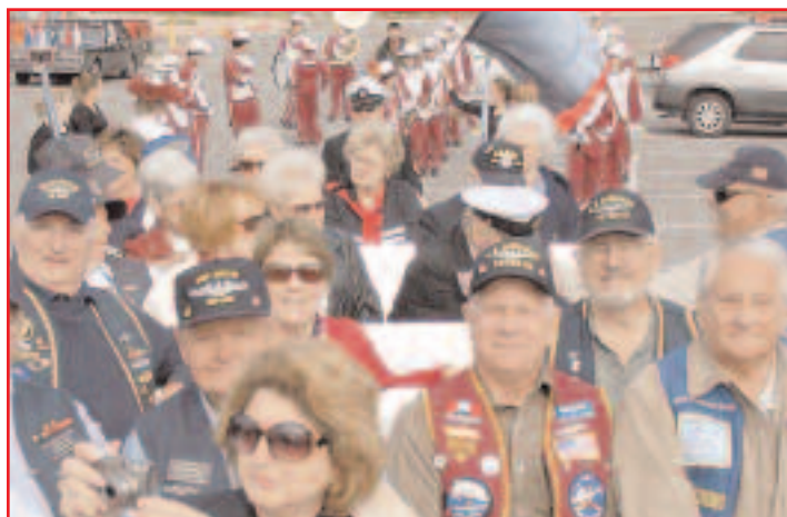
Ozark Runner Base float loaded with submariners for the Veteran's Day Parade in Branson, Missouri.