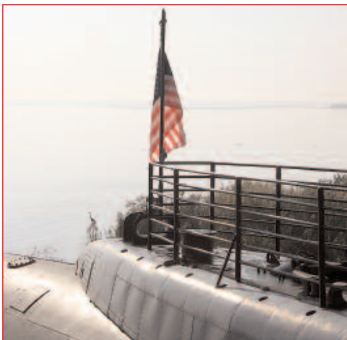
The United State flag flying from the stern of the USS Drum (SS-228) in Mobile, Alabama.