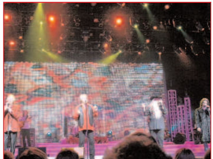
The Oak Ridge Boys performing to a full house.