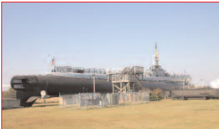
USS Drum (SS-228) is part of BattleShip Park in Mobile, Alabama.

This museum and the Flight Museum in Pensacola took an almost direct hit from Hurricane Katrina but you would not know it now.