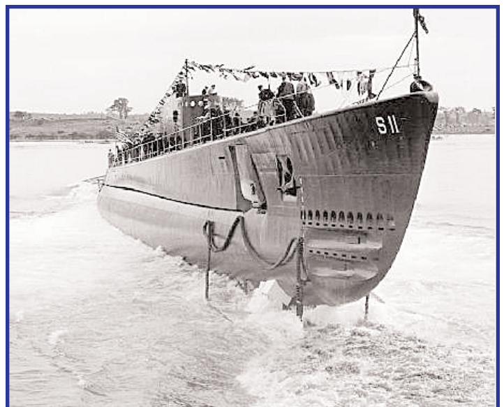
USS Squalus being launched at the Portsmouth Naval Shipyard in Kittery, Maine