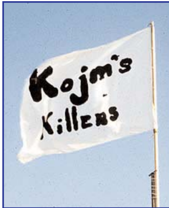
Flag flying from the mast upon our return from Cuban Crisis in 1962.

It was with great sadness that we gathered to pay our respects to our beloved skipper, Len R. Kojm, at Arlington National Cemetery on December 1, 2004