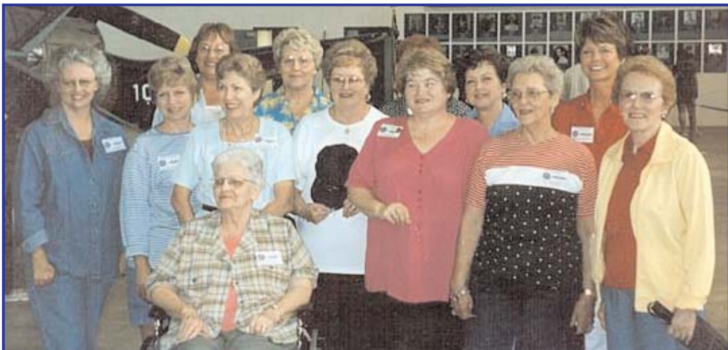
Above are the First Mates of the attending shipmates.