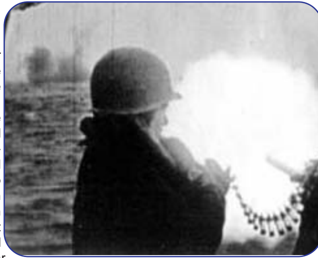
Dave Green mans the gun to sink a Japanese trawler in '45

tained no damage. Later we sent two fishing boats to the bottom in a surface attack. During this attack our twenty millimeter gun blew up and injured three crew members who were manning the five inch