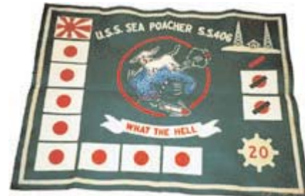
World War II Battle Flag

Editors Note: Do to space limitations, we are unable to print the Muster Lists in their entirety. More will appear in the next issue.