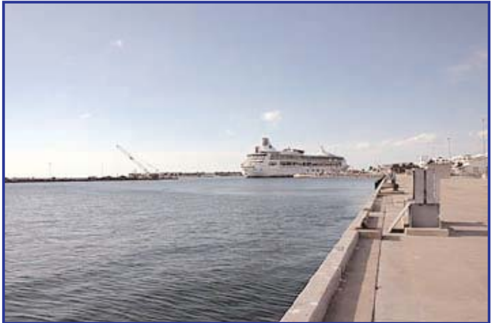
Photo by – Jack Merrill TM 61-63 Anyone Recognize This Photo? – Hopefully, our reunion hall will not look like this! Key West Submarine Basin, minus the piers, in March of 2004 is a deserted and much changed place.

We'll have a barbeque & smoked chicken dinner from 5 to 8