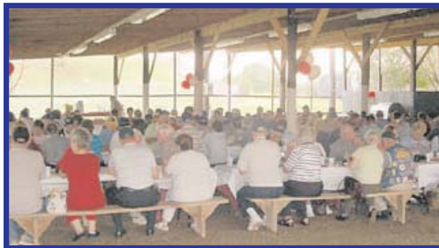
Feasting at the Sullivan's island barbecue at the 2004 reunion.