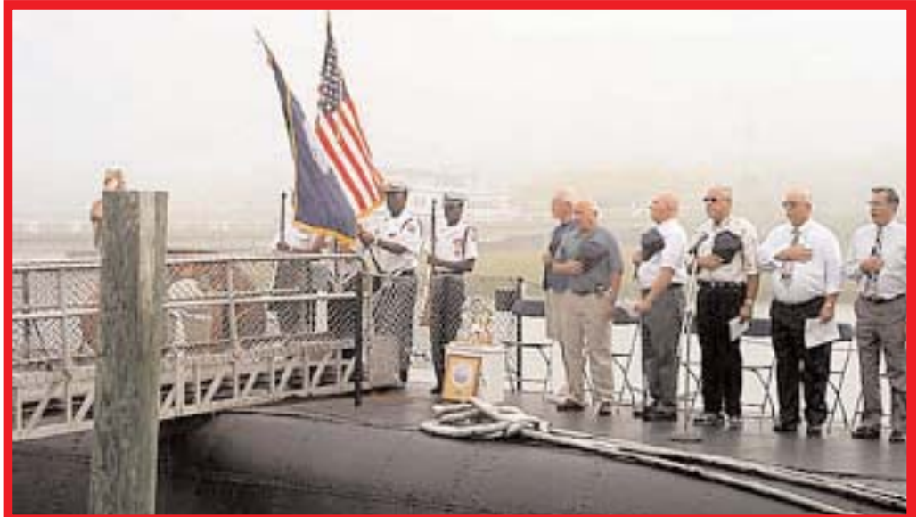
Memorial Ceremony aboard the USS Clamagore (SS343) at Patriot's Point Naval Museum in Charleston during our 2004 reunion.

Also, by attending the reunion, you help make the Association a living, vibrant organization. We all had a great time renewing old acquaintances with former shipmates and meeting the shipmates