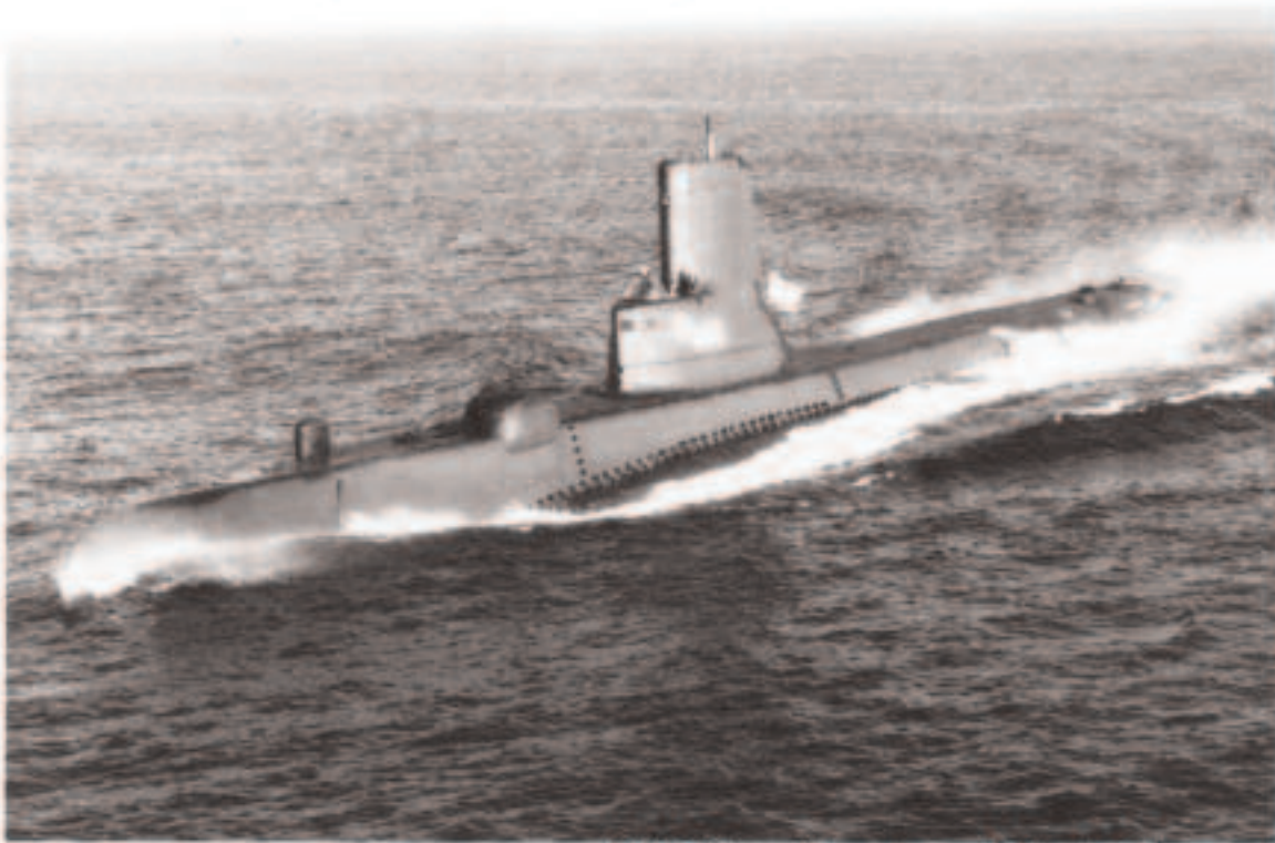
USS Sea Poacher (SS 406)

Cristmas Card