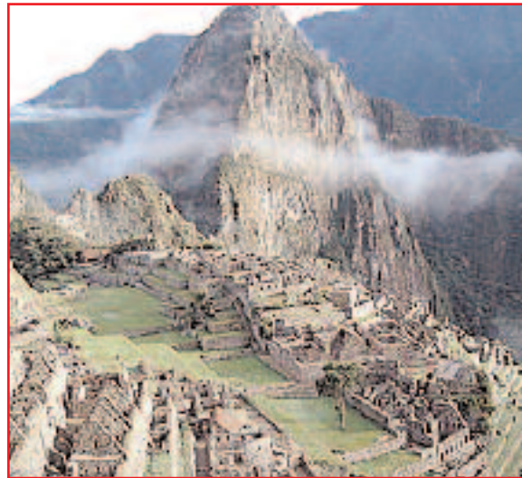
Macho Pichu above. Nasca Lines below.

We have added NAZCA Lines as an option to the itinerary, which means travelers who want this must leave the U.S. on March 3 for this travel on March 4 before flying to Cuzco on March 5. Whether these extraordinary Lines were done by the NAZCAs 1500-2500 years ago